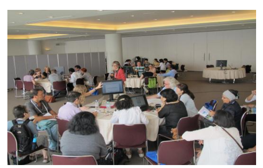
Roundtable session at Yokohama

Do not hesitate to contact the editors for more information.